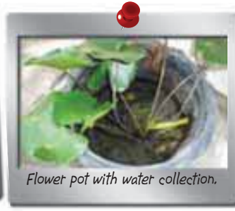
Flower pot with water collection.