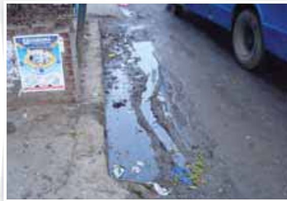
Unpaved and undulated surface with waste water littered