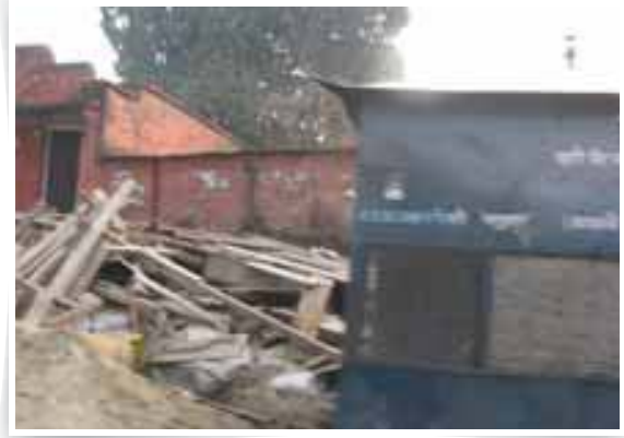
Unclear of Construction Formwork after Buiding Construction