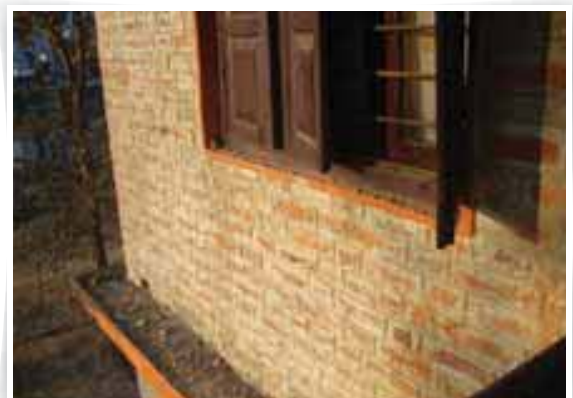
Unfinished Chajja may retain water