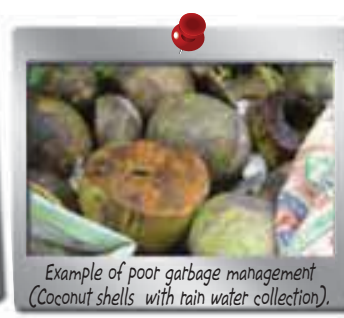
Example of poor garbage management (Coconut shells with rain water collection).