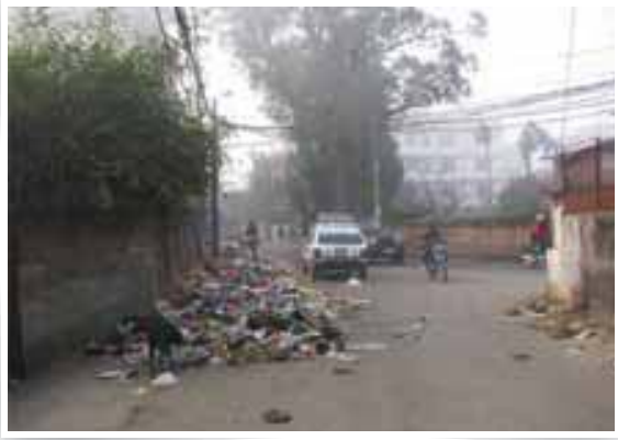
Waste Collection on the road side