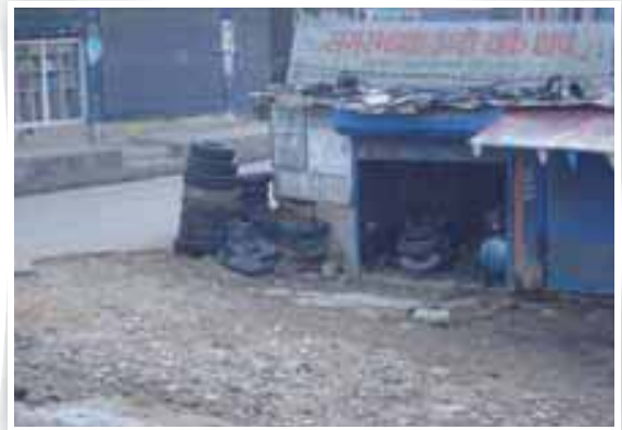
Old and unused tyres usually stacked on the road side