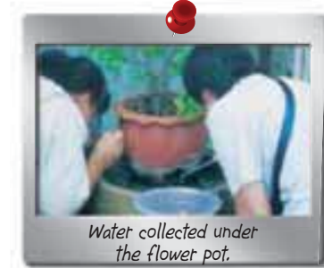
Water collected under the flower pot.