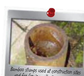
Bamboo stumps used at construction sites and for fencing collecting rain water.