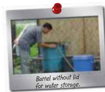
Barrel without lid for water storage.