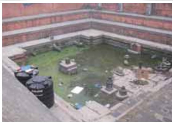
Water logged area near by Residential and Office complexes