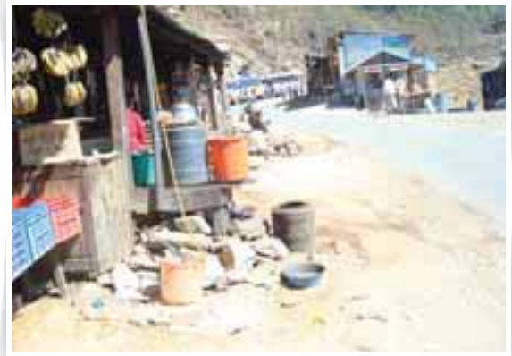
Water Container without Lid