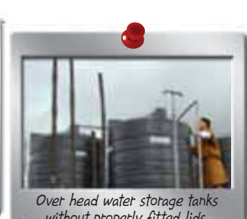
Over head water storage tanks without properly fitted lids.