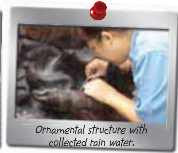
Ornamental structure with collected rain water.