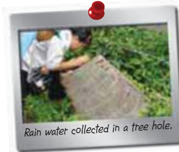
Rain water collected in a tree hole.