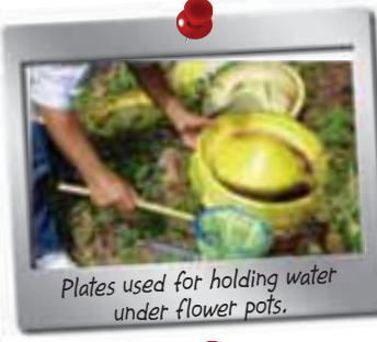
Plates used for holding water under flower pots.