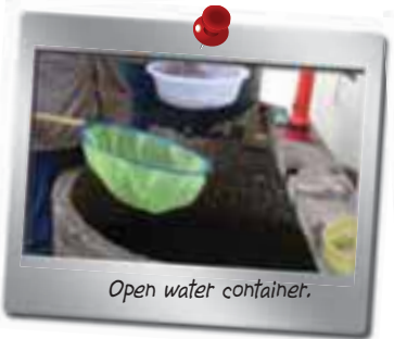
Open water container.