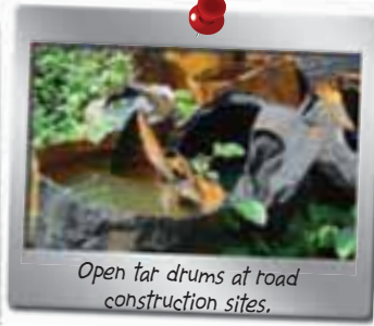
Open tar drums at road construction sites.