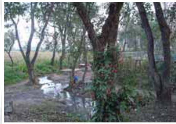
Poorly constructed and inadequate drainage systems hindrance storm water making them waterlogged