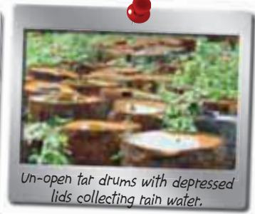
Un-open tar drums with depressed lids collecting rain water.