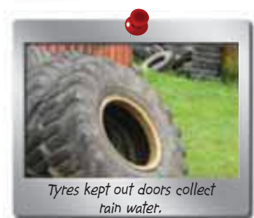
Tyres kept out doors collect rain water.