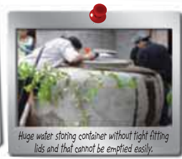
Huge water storing container without tight fitting lids and that cannot be emptied easily.