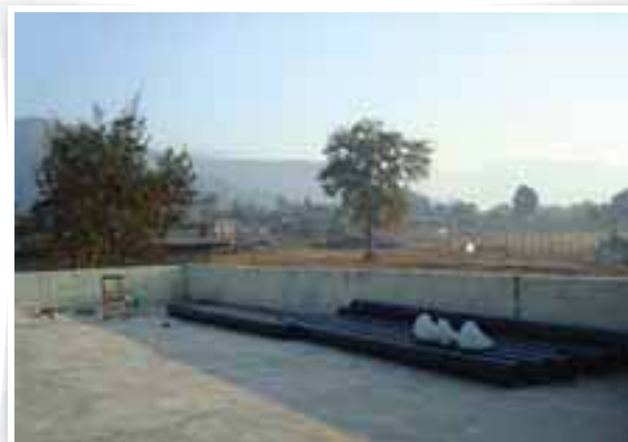
Storage of building materials on the roofs may retain water